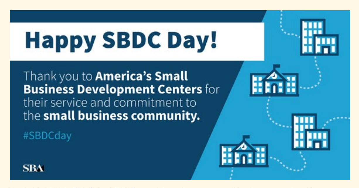
March 21, 2018 is SBDC Day! SBDCs provide assistance to small businesses and aspiring entrepreneurs throughout the United States and its territories. SBDCs are hosted by leading universities and state economic development agencies, and funded in part through a partnership with SBA. Connect with a <a href="SBDC">SBDC</a> near you!